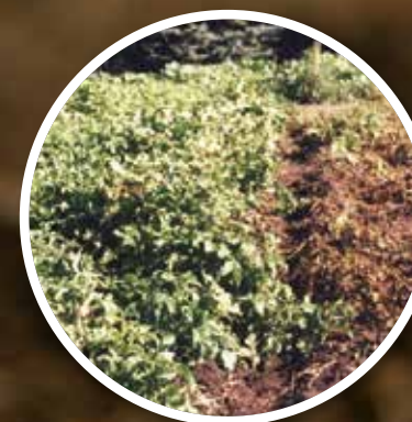
AUGUST 15, 2001 – VIGOROUS, HEALTHY PLANTS TREATED WITH HEADS UP® (LEFT) VS EARLY DIE DOWN OF UNTREATED (RIGHT)