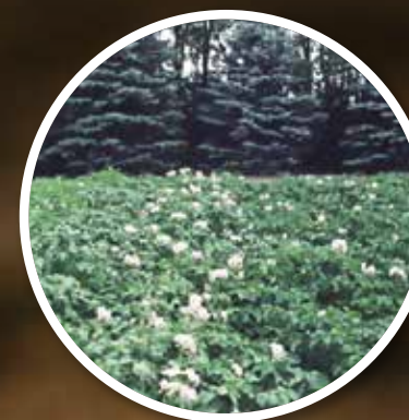
JULY 14, 2001 – INCREASED FLOWERING WHEN TREATED WITH HEADS UP® (LEFT) VS UNTREATED (RIGHT)