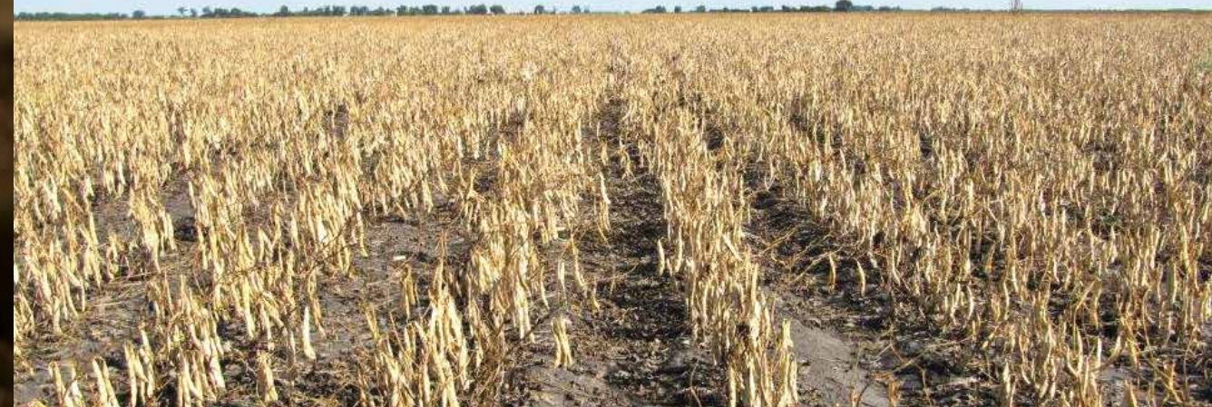
PINTO BEAN FIELD TREATED WITH HEADS UP®. WINKLER, MB 2013.

For more Information, visit us online WWW.HEADSUPST.COM