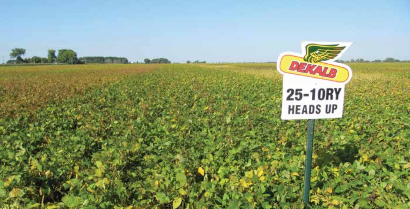
SOYBEAN YIELD TRIAL. GJ CHEMICAL ALTONA, MB 2013 DeKalb 25-10RY soybeans are trademarks of Monsanto Company.