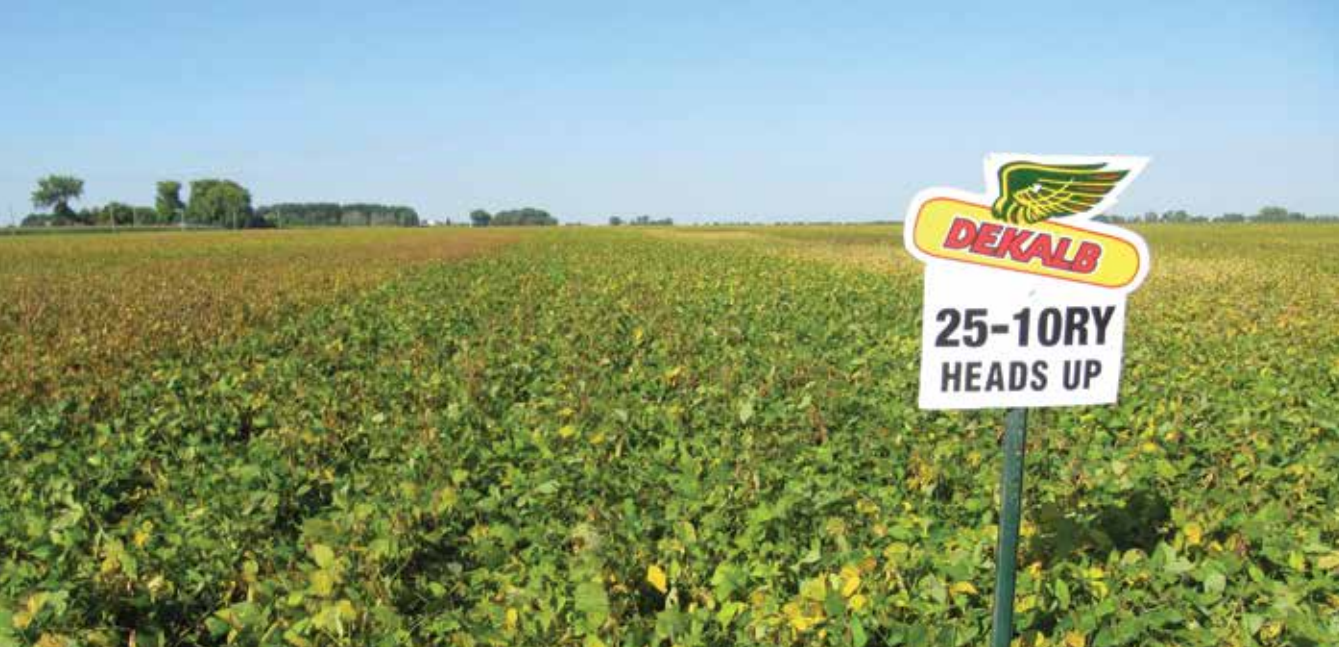
SOYBEAN YIELD TRIAL. GJ CHEMICAL ALTONA, MB 2013 Deklab 25-10RY soybeans are trademarks of Monsanto Company.