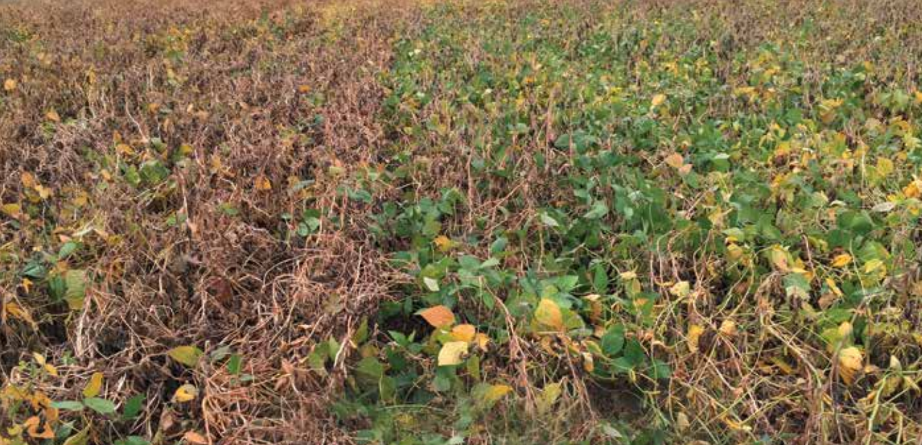
2017 SOYBEAN FIELD TRIAL | SEVERE WHITE MOLD – PERHAM, MN Left side Untreated; Right side treated with Heads Up®